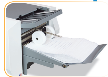
Integrated Output Conveyor

The FD 1502 Plus is built with proven Formax technology. Heavy-duty steel construction offers the dependability and power expected of a larger unit in a smaller package. A hopper capacity of up to 200 forms and processing speed of up to 6,250 forms per hour enables an operator to complete daily jobs in no time. Plus, the integrated output conveyor keeps processed forms in a neat, sequential order.